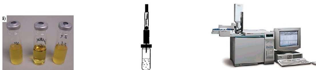
Figure 1: Analysis of rhizobacterial volatiles by SPME-GC/MS

A rhizobacterial strain was grown in a liquid culture to gather a rhizobacterial volatile, a solid phase microextraction fibre (SPME — a technique for the extraction of volatile organic chemical compounds from liquid), coated with polydimethylsiloxane was used. In this process, chemical vapours rise above the liquid test sample and stick to the fibre. The fibre (SPME) was then placed in the Gas chromatography machine coupled with mass spectrometry (GC/MS — It is a technique that can be used to separate and identify chemical compounds) to detect VOCs produced by the commercial rhizobacteria (Fig.1). i. vials inoculated with rhizobacteria, ii. Extraction of volatiles by SPME, iii. GC-MS analysis.