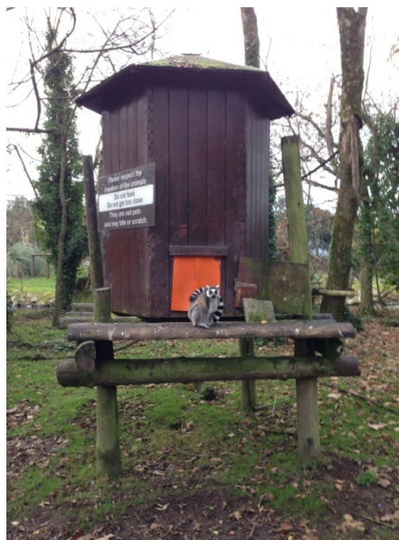
Figure 1: One of Fota's Free-range Ring-tailed Lemurs.

Fota Wildlife Park has ten free-ranging ring-tailed lemurs. They are a small cat-sized primate endemic to the island of Madagascar, with a characteristic black and white striped tail. In the wild they are listed as near threatened because of habitat destruction (see Fig. 1). They are a charismatic animal that does well in captivity, and are a favourite among zoo visitors. At Fota Wildlife Park, the lemurs are restricted to the island of Fota, but they are not confined in traditional zoo enclosures. It has previously been shown that visitors learn more from animals that are free-ranging, and it also benefits the animals. However, zoo animals that are free-ranging also experience more intense interactions with visitors.