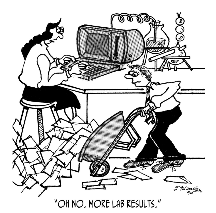
Figure 1: Oh no. More lab results.

laboratory testing and fishing. He stated that "often, these are fishing expeditions, and since no one is perfectly normal you tend to find a lot of fish". Are we catching too many fish, and what will we do with them? With this in mind, the effective use of resources to perform the right test at the right time is essential for ensuring the quality of patient outcomes. Also, the value of any test is subject to how likely a patient is to have a significant problem in the first place. For example, tiredness or 'fatigue' is a symptom of many conditions including anaemia, coeliac disease, depression, diabetes, glandular fever and underactive thyroid, just to mention a few. However, a patient presenting with 'fatigue' may not need laboratory investigations, or at least not for each of these conditions. The decision to request a test needs to be considered in the wider context of the patient's clinical picture — an amalgam of their history and any findings on examination.